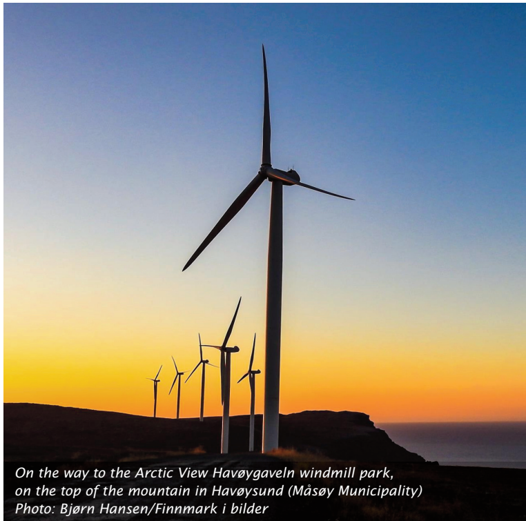
On the way to the Arctic View Havøygaveln windmill park, on the top of the mountain in Havøysund (Måsøy Municipality)