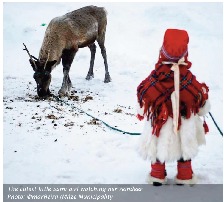
The cutest little Sami girl watching her reindeer Photo: @marheira (Máze Municipality)