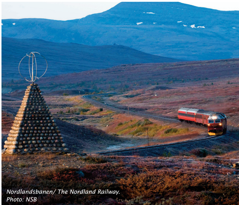
Nordlandsbanen/ The Nordland Railway.