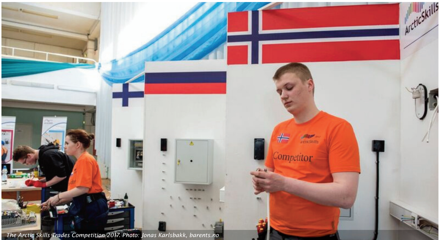
The Arctic Skills Trades Competition 2017.