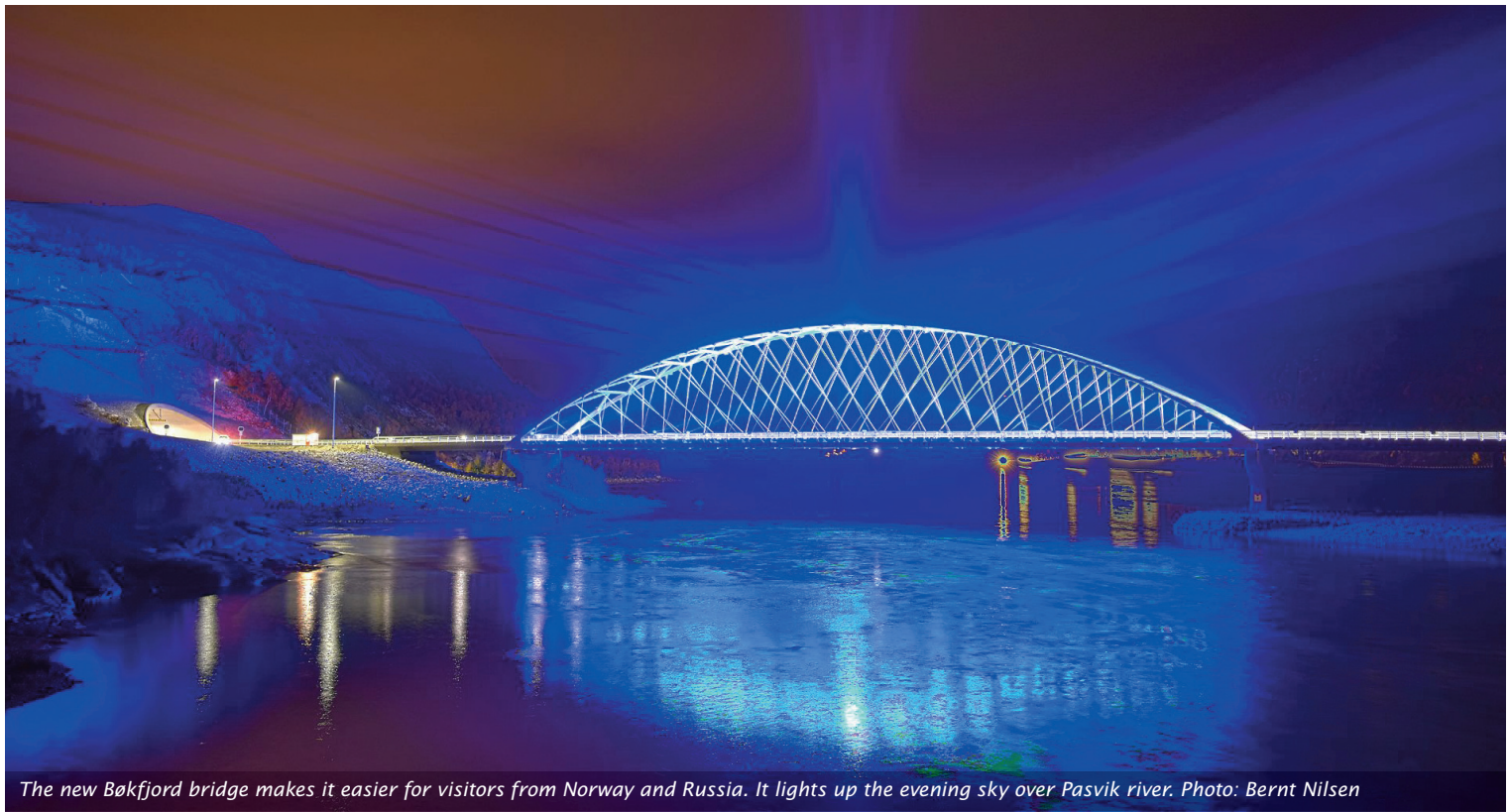
The new Bøkfjord bridge makes it easier for visitors from Norway and Russia. It lights up the evening sky over Pasvik river.