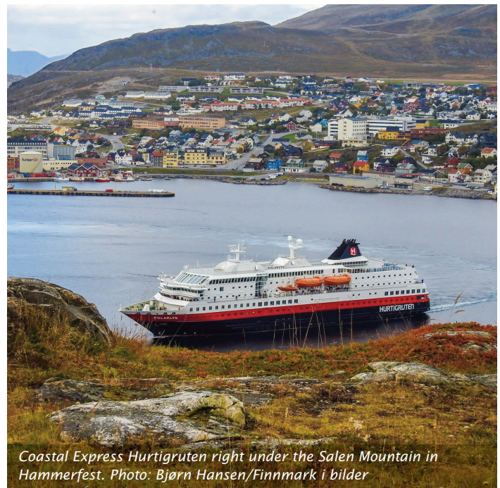
Coastal Express Hurtigruten right under the Salen Mountain in Hammerfest.