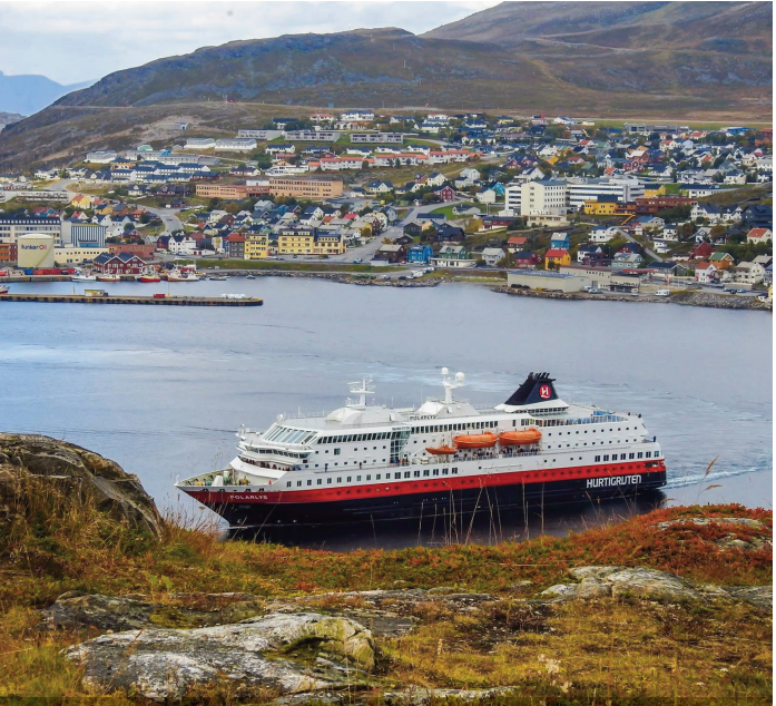
Coastal Express Hurtigruten right under the Salen Mountain in Hammerfest.